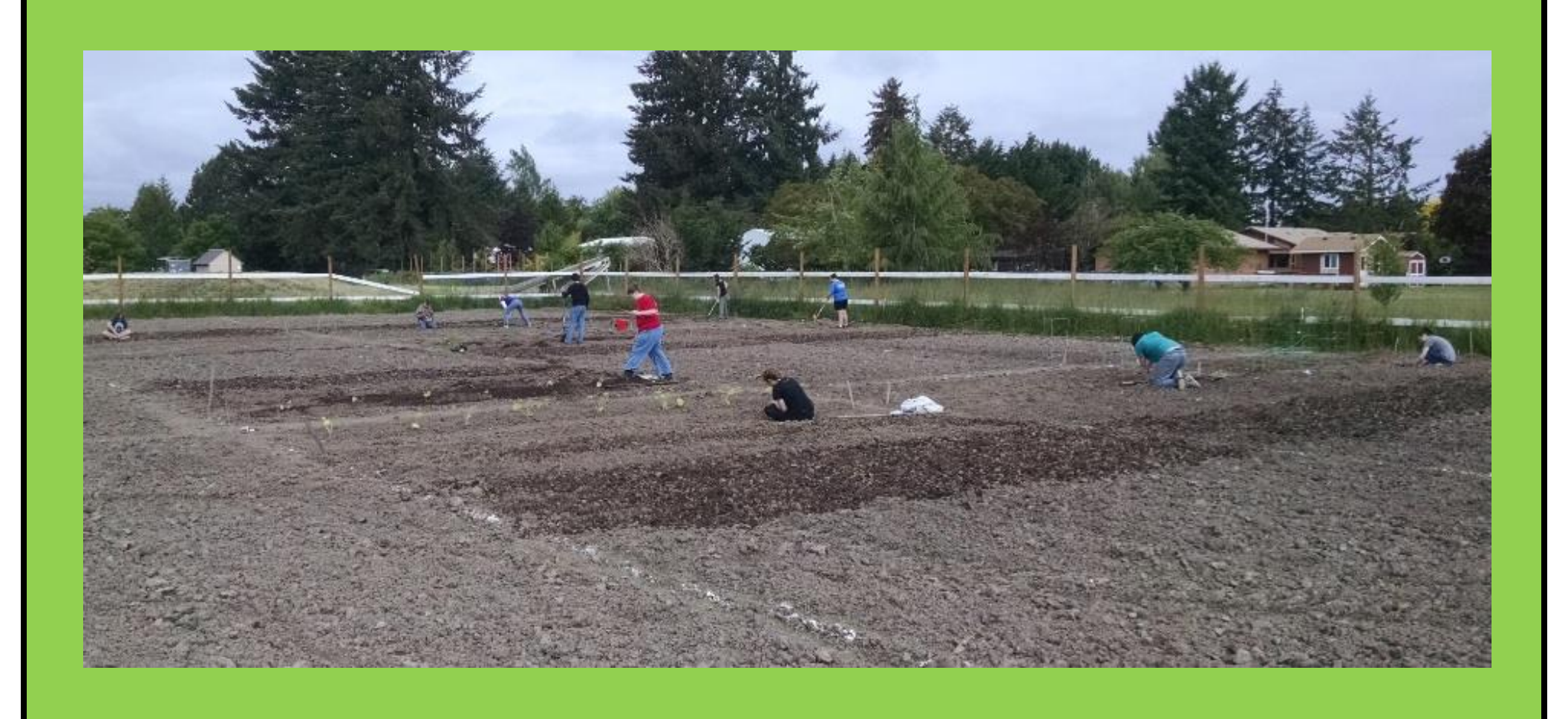
Starting to Plant