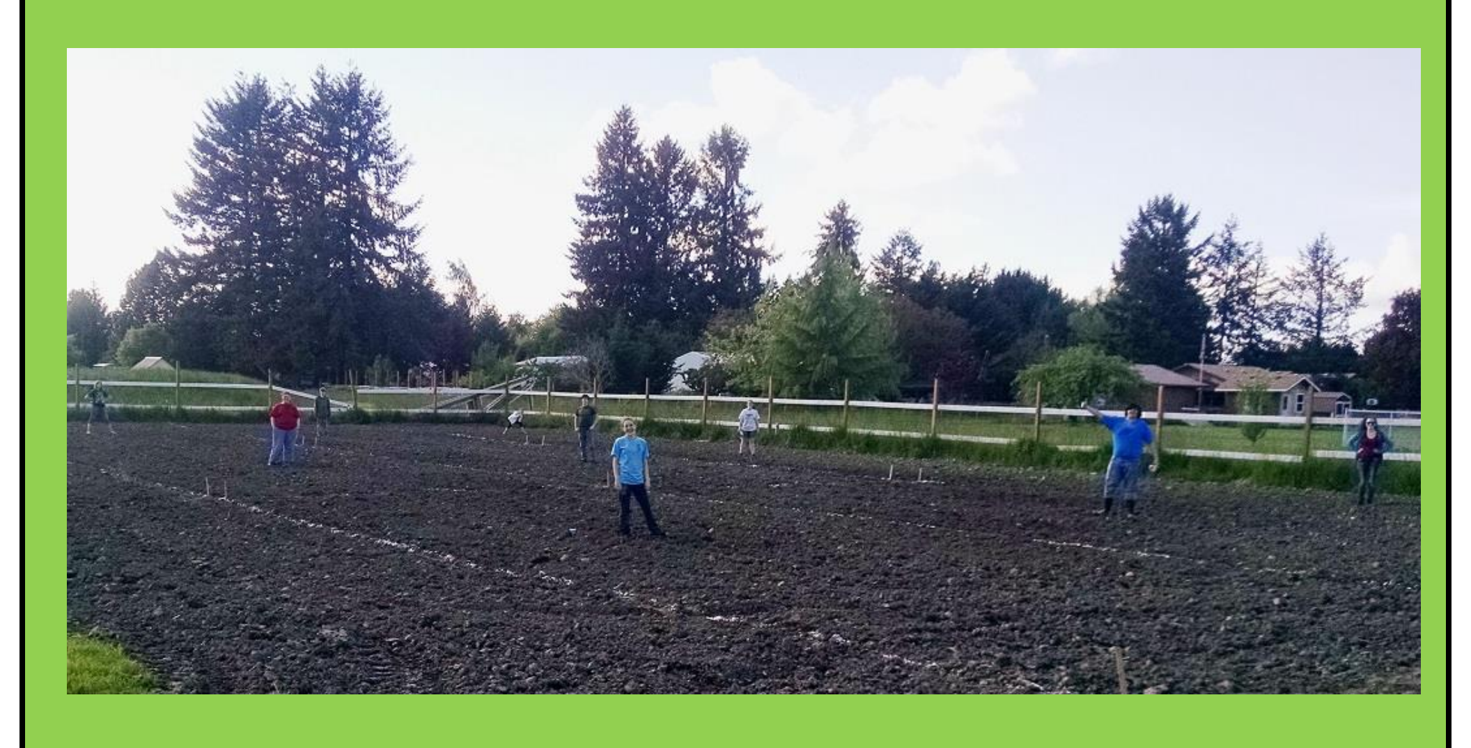
Ready to Plant