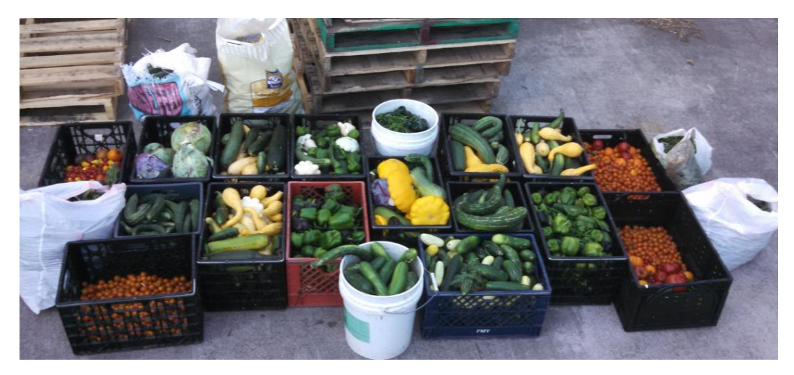
One Weeks Harvest in August