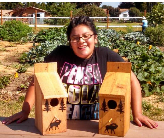
Veronica's Bird Houses