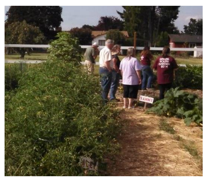
Our Open House