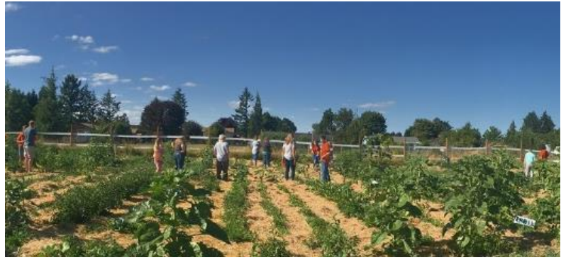
Giving Tours During Our Open House

Our interns will be exhibiting their vegetables, flowers, and herbs at the Polk County Fair this year in the Horticulture Building August 9-11. During the Fair our interns will also be available to answer questions about the garden at our booth which will be open Friday August 10 th 11am-3pm in the 4H Building . As a fund raiser we will also be selling peaches. Stop by and get a peach!