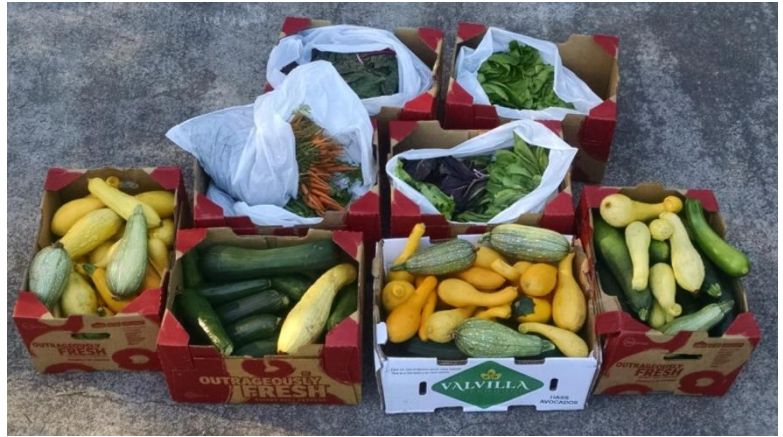
Typical July Harvest